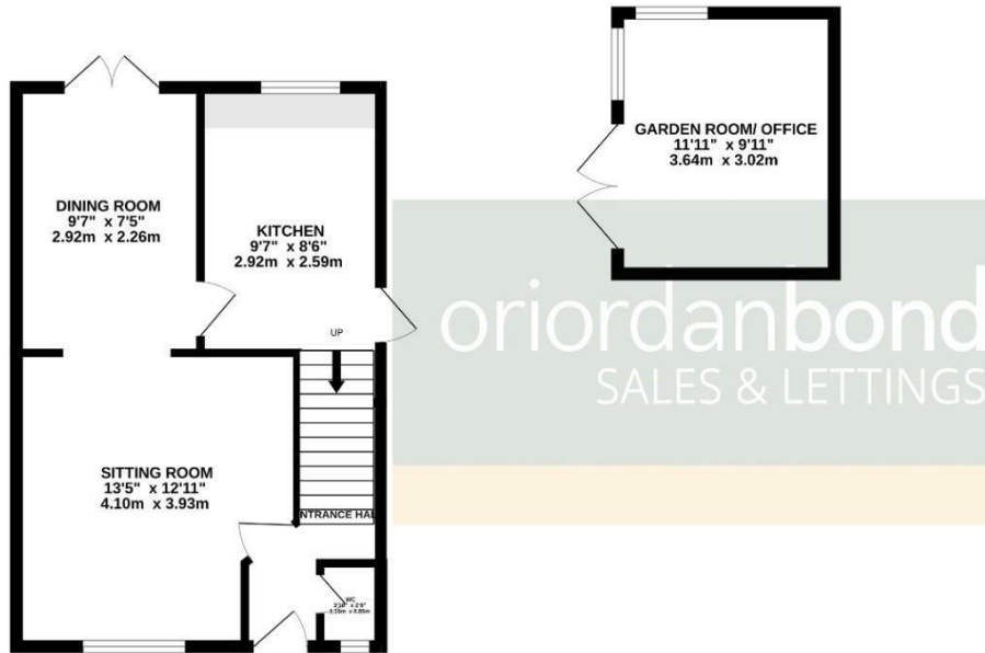
GROUND FLOOR 546 sq.ft. (50.7 sq.m.) approx.